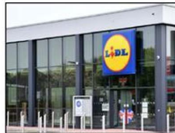
Example of the Marks as used by Lidl