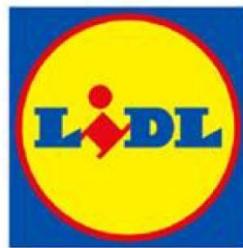
The Mark with Text